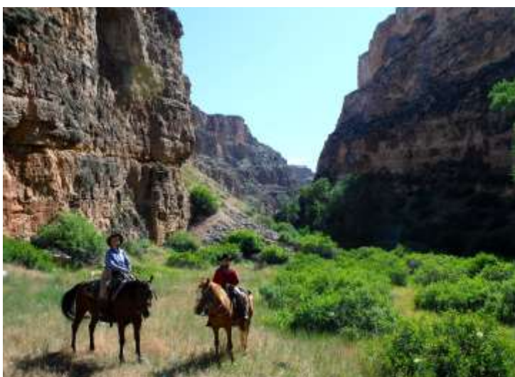
Day 6 (Friday) Breakfast and perhaps an all-day ride to the dramatic Copman's Peak with picnic lunch carried in saddle bags. Return to the ranch in the late afternoon for showers and time to relax before a friendly end of week BBQ with wranglers and guides. Final night at the ranch (B,L,D)

Day 7 (Saturday) Breakfast on your final day before departing (check-out 10.00). (B)