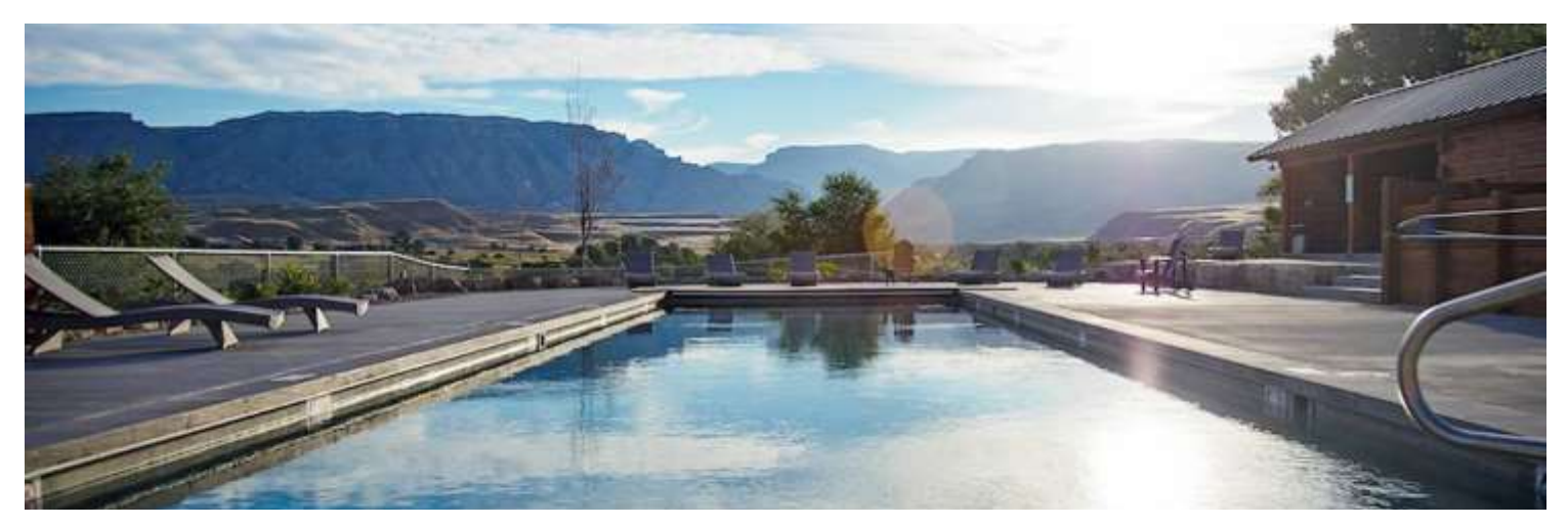
Days 3 to 5 (Tuesday to Thursday) Three full days to enjoy the ranch with morning, afternoon and full day rides on offer. Daily riding will be organised to suit – you can chat with the head wrangler or owners Peter and Marijn each evening to decide how much riding you would like to do the next day. There are numerous routes for morning, afternoon and full day rides. Optional riding lessons may be available as well as some low key cattle work with an afternoon learning how to gently move cattle between grazing or to try your hand at 'penning and sorting'. You can also learn to fly-fish with the ranch's guide and if you do not wish to ride, might try your hand at archery targets or trap shooting or perhaps take the afternoon off to swim and relax or drive into Cody for some shopping and dinner before the night Rodeo in summer (extra charge). Three nights Hideout (B,L,D)

Day 2 (Monday) After breakfast, meet in the Barn at about 8.30am for an introduction to the wranglers, horses and a short demonstration of riding techniques used on the ranch. Mount up and after ensuring you are well matched with your horse, tack and fellow riders, either head off on a first ride close to base or horses may be loaded into trucks and taken a little further afield to explore. Return to base for lunch at about 12.30pm and a rest before an afternoon ride or different optional activity, returning to the ranch in the late afternoon. Drinks in the main bar at about 6.30pm, then dinner and night (B,L,D)