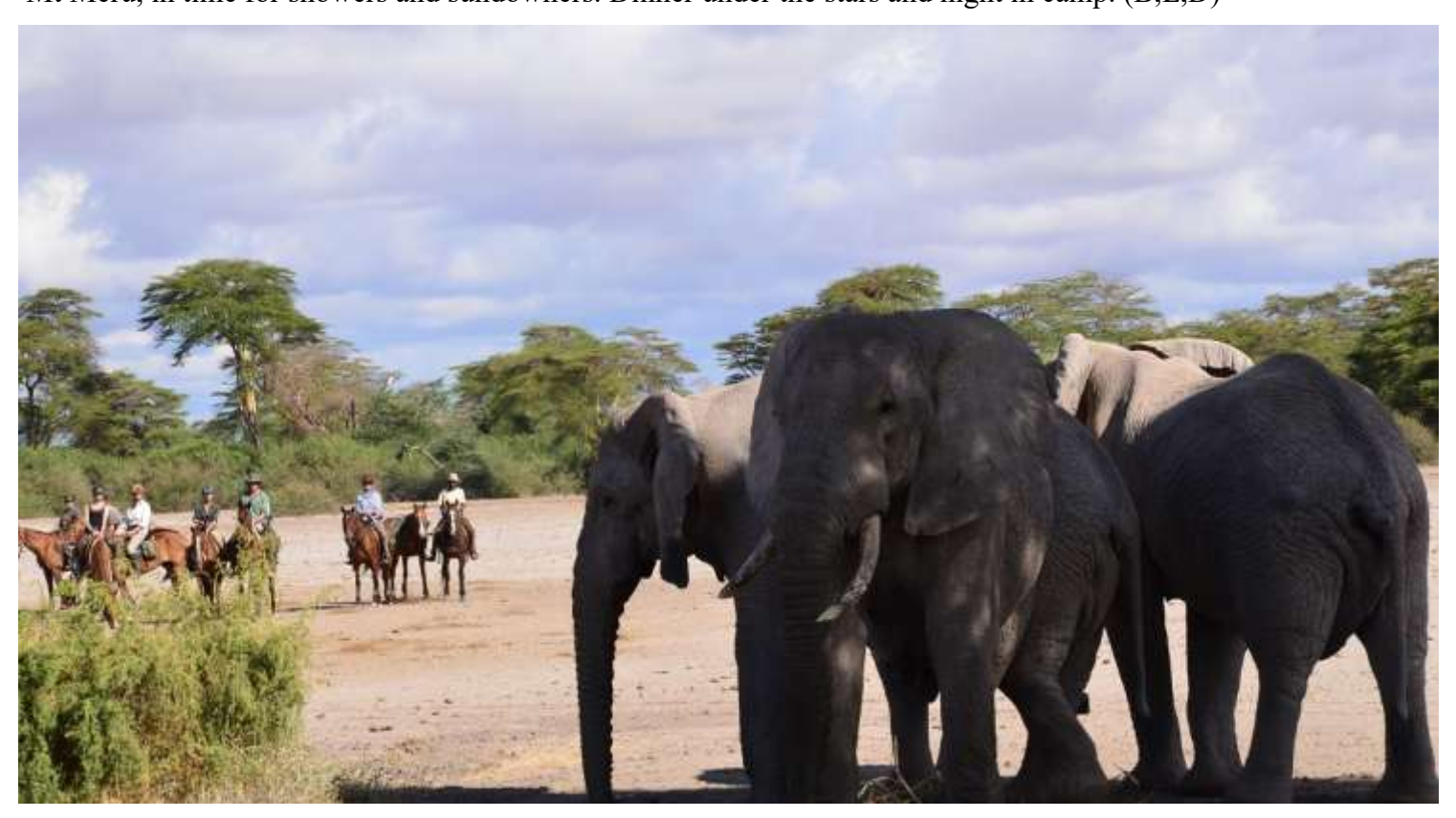
Day 3 - Wake up with the sun to the sounds of Colobus monkeys chattering and after breakfast in camp, set off riding towards the area made famous by the John Wayne film 'Hatari'! After riding for a couple of hours, the horses start climbing up towards a point which (if the weather is clear) provides a magnificent view of Mount Kilimanjaro. A vehicle will meet you for the last steepest section, and leaving the horses you pass the "Fig Tree Arch", a massive natural archway (big enough to fit 5 horses underneath!), before getting to the lunch stop, next to a waterfall at around 2000 meters above sea level. After a leisurely lunch and siesta, meet the horses again and ride back to camp by a different route. A cup of tea in camp, then those who wish may be able to head out in vehicles to the Momella lakes to look for hippo and water birds. Sundowners on the lakeshore then head back to camp for showers and dinner. Night in camp. (B,L,D)

Day 2 - A leisurely breakfast and then you will be collected and driven about 30 minutes to the gateway to Arusha National Park where the horses are waiting. Mount up and once everyone is settled with their horse, set off riding into one of the most beautiful Parks in East Africa. As you ride deeper into the Park, the vegetation changes dramatically, from open grassland plains to thick canopied rainforest, and with this there are good chances to see a wide variety of game – buffalo, giraffe and plains game, elephant and some unusual species such as rare Suni antelope, Red Duiker and Colobus monkeys as well as gorgeous birdlife such as Hartlaub's turaco and much more. The back-up crew will meet you along the way with a delicious lunch and, after a short siesta, continue riding through the canopy forest, good leopard country, and past the old house of the legendary Margarete Trappe, known and remembered as the 'Iron lady' from the first World War. Arrive at the first camp, set up at the foot of Mt Meru, in time for showers and sundowners. Dinner under the stars and night in camp. (B,L,D)