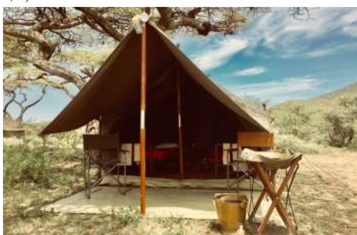
Day 7 - A wake-up call at dawn to make the most of your last full day, then mount up to ride out early when the light and game viewing is often best. An exhilarating morning ride exploring the area between the border with Kenya or towards Amboseli National Park, tracking game as you go. Hopefully there will be good chances to watch the elephant that constantly move through this area and you might also spot shy lesser Kudu, family groups of giraffe or perhaps smaller predators such as jackal or bat eared fox. Back to camp for lunch and a siesta or you might meet the back-up crew for a delicious lunch out riding heading back to camp in the afternoon. Hot showers in camp and a magical evening overlooking the pans, where plains game is ever alert for predators on the prowl. Hopefully the skies will be clear, as views of the mountains and glorious night sky, are superb. Dinner and your last night on safari. (B,L,D)

Day 8 - Breakfast and pack up before setting off on the drive back to Kilimanjaro airport / Arusha (about 3 hours). For those with late onward flights a day room can be arranged (extra cost). (B)