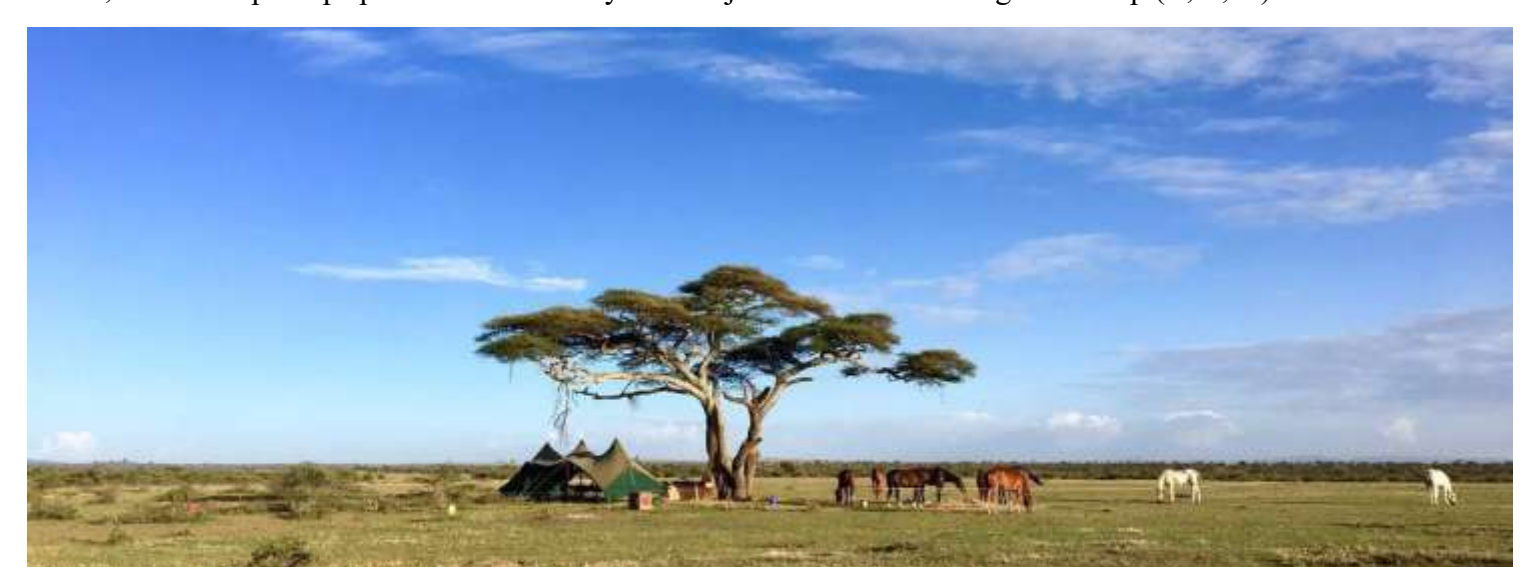
Day 4 - The day-by-day programme will vary with the game, but your guide always aims to move camp a couple of times during the week so you can explore new areas. Today might be the first moving day with an early wake up at dawn giving time to pack-up before breakfast. Then, after mounting up, ride out towards the new camp, through areas that have rarely been visited on a horse, perhaps passing Maasai herdsmen or their small settlements, where tribesmen live off the land as they have done for centuries. After about 4 hours riding, the sight of the back-up crew who have gone ahead to set up a delicious al- fresco lunch in the bush, is welcome. Time for a long rest in the heat of the day, then horse are tacked up again and you head off, aiming to reach the new camp by tea time. Set up ahead, the camp might be spectacularly situated in the middle of vast open plains, where, at peak migration time, the air will be filled with the braying and mesmerizing grunts of wildebeest. Tea or a cold beer when you arrive, followed by hot showers & dinner in camp, listening to the sounds of the bush (B,L,D)

Day 3 - Woken at about 7am with tea or coffee brought to your tent, then breakfast in the mess tent before heading to the horses at around 8am. Plans each day always vary with weather and game, but on the first full safari day, you might ride out for a long morning to get used to the horses and area, returning to camp for lunch before another ride or game drive in the late afternoon. Or it might be a good day for a full day ride, meeting the back-up team for lunch out in the bush. Either way there's a good chance of trying your horse at all paces and with luck, of seeing the gathering herds of wildebeest for which the area is famous, as well as giraffe browsing acacia scrub, zebra and perhaps predators such as hyena and jackal. Dinner and night in camp (B, L, D)