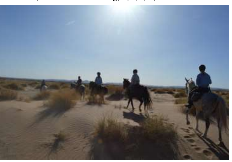
Day 7 - Breakfast in the Riad and your last mornings ride through the beautiful Chebbi Erg dunes, some of the highest in Morocco. The sand changes colour with the light, from deep orange, to gold, then silver. After a couple of hours riding through the sand you meet the back-up lorry and here you say good bye to the horses. Board the mini-bus and set off driving in the direction of Erfoud, Boumalne Dades, across the 1000 Kasbah Valley to reach Ouarzazate. Check-in to your hotel with the rest of the afternoon to relax by the pool or explore the town. A farewell dinner with your guide at a local restaurant. Night at the hotel in Ouarzazate (about 2 hours riding and 5 hours drive). (B,L,D)