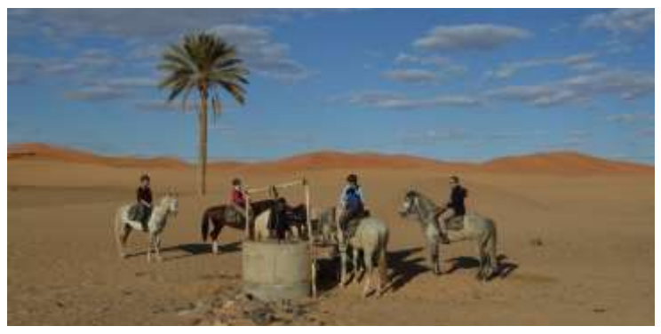
Day 5 - Breakfast and then tack-up and set off riding, firstly through the splendid dunes and then following tracks into the rocky hills. Water the horses at a small well just outside a remote village, small, simple houses with the remains of a Kasbah, the red mud constructed fortresses typical of southern Morocco, close by. Stop for a picnic and then in the afternoon continue across open plains to the village of Taghaoucht-n-Jdaid. The night is spent in a lodge close by (4 to 5 hours riding) (B,L,D)