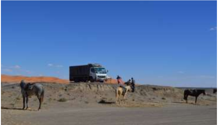
Day 3 - Breakfast and then tack up the horses and set off riding, firstly through Tafraoute village and then across the plateau of Ahbouche Ktbouyte, ideal terrain for a good canter. At midday you meet the back-up vehicle and stop for a picnic lunch in the shade of an acacia tree. Time for a siesta before saddling up again and following a route which takes you into a broad valley, between the mountains of Djbel Mohre to the right & Djbel Zireg to the left. You can admire the breathtaking landscapes of the Sahara desert; endless dunes with majestic cliffs in the background. In the late afternoon you arrive at a charming little desert lodge located in Mharech valley. Dinner and night at the desert lodge (4 to 6 hours riding) (B,L,D)

Day 4 - Today's ride continues east, crossing a small pass and then dropping down into Wad Griss. Immerse yourself into the desert scenery, dry austere mountains of black rock, red pinnacles, table tops, and golden dunes - a truly grandiose landscape. After stopping in a small stand of thorn trees for lunch, you set off again, crossing a wonderful stretch of packed sand which provides the chance for a long gallop. The Algerian border is only 5km to the south now and you turn north east to the sand hills of Ouzina. The night is spent in a comfortable inn on the edge of the dunes. (4 to 6 hours riding) (B,L,D)