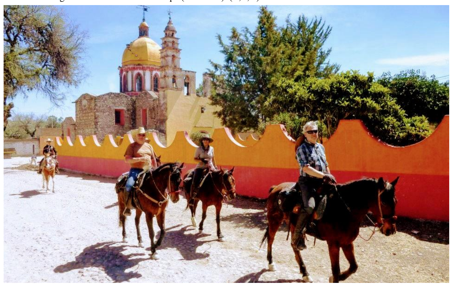
Day 7 - In the morning, after breakfast served by the pool, you mount up again, heading for your final destination, San Miguel de Allende. The route follows old roads that were used during the War of Independence and the Mexican Revolution. As you ride along the shores of the river Laja you will pass shrines left by the indigenous population, pre-Colombian tribes who worshipped this land. Stop for a picnic lunch and in the afternoon the ride takes you through a unique landscape, a combination of semi-desert and wetlands, makes todays ride all the more interesting. There is a marvelous tranquility as you pass rural scenes and each step of your horse is an enjoyment. In the late afternoon you arrive at San Miguel de Allende (UNESCO World Heritage Site). Your hotel is just a few steps away from the main tourist attractions, museums, restaurants and bars. San Miguel is a town full of magic and mysticism - a place full of culture and art and there is almost always a festival or event taking place. Dinner will be at a local restaurant. Night at Hotel Acuarela (or similar). (B,L,D)

Day 6 - In the morning, after breakfast accompanied by a typical Mexican coffee "café de la olla", you set off riding again, heading towards to the town of Atotonilco. Ride through the Cactus Valley and past the historic hacienda "La Erre", an interesting property which played an important role during the war for independence. Stop a picnic for lunch, in a picturesque town, close to an old chapel of the Barron community. In in the afternoon you reach Atotonilco, where you will see the imposing walls of the XVIII century church. This invaluable architectural treasure is known as the Sistine Chapel of Mexico due to its beautiful murals and other decorations. Dinner and night at the Nirvana Hotel & Spa (or similar) (B,L,D)