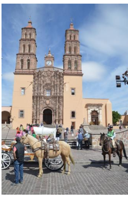
Day 5 - Today you ride through one of the most important historical cities of Mexico, known as the " Cradle of Mexican Independence ". The famous cry for freedom (Grito de Libertad), was the call to take up arms against the colonial regime and the Spanish crown. It was initiated at dawn on 16th September 1810 by the priest Miguel Hidalgo y Costilla. A brief tour of the town by horse, passing some of the most emblematic buildings of Mexico's war for independence. Lunch will be at a local restaurant and in the evening you may visit the "Wine Museum" and the "Real Mexican Cantina" or you can explore the various shops with their great variety of local handicrafts. Dinner will be in a typical and unique Mexican restaurant situated in the central park, famous for its delicious traditional dishes. The fireflies and scent of flowers create a wonderful ambience. Night at Hotel Hidalgo (or similar). (B,L,D)