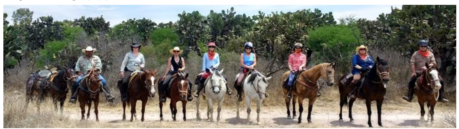
Day 8 - Breakfast and own arrangements for onward travel (extra nights can be booked if you would like to spend longer in San Miguel). (B)