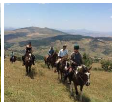
Day 6 - Breakfast at the guesthouse then mount up to head off again. One by one there are views of the four main lakes of the Park - Maulazzo, Biviere, Cartolari and Tre Arie; to the south the mass of Etna Volcano dominates the landscape and to the north you can see the Eolian island archipelago and the Tyrrhenian Sea. Stop for a saddlebag picnic lunch (again the vehicle cannot access this area) near a refuge close to lake Cartolari. In the afternoon continue the descent into the Flascio Valley on the slopes of Mt Etna - now so close you feel you could reach out and touch it. Leave the horses at a local farm and transfer a short way by minibus to the Fucina del Vulcano Hotel, a comfortable modern style hotel with exceptional views towards Etna. Dinner and night at the hotel. (B,L,D)