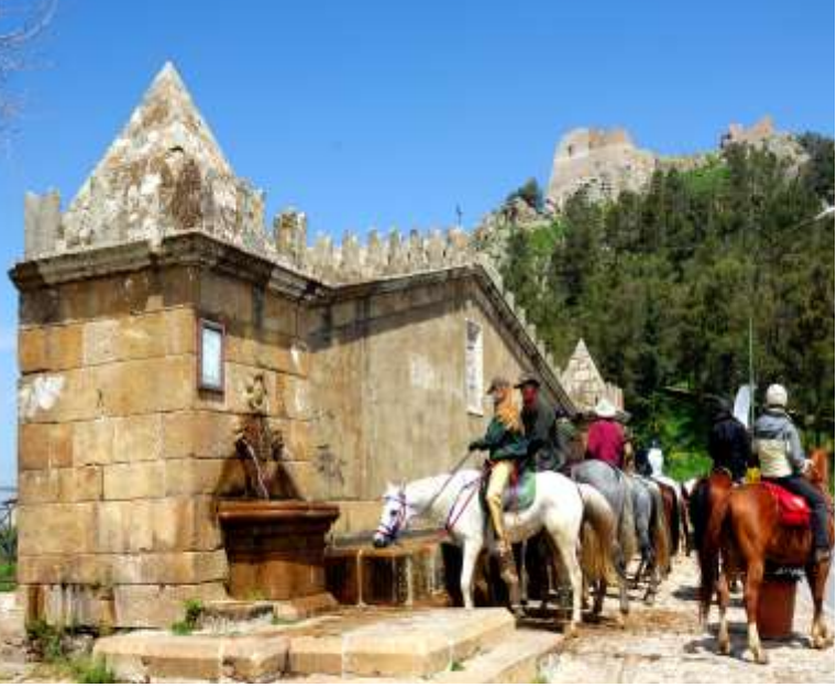
Day 3 - Breakfast, a short drive back to meet the horses at Piano Battaglia. The route today takes you to some of the highest peaks of the Madonie mountains. Climbing through dense beech woods, you reach the Sanctuary of the Madonna dell'Alto: one of the highest and oldest in Europe. From here, head down to the villages of Pettralia Sottana and Petralia Soprana which you skirt to reach the lunch point close to an ancient Roman road. After lunch the ride continues past the town of Gangi, which was once a Mafia stronghold to finally reach a country guesthouse Villa Raino where the night is spent. Depending on the weather and time of year, there may be time for a swim in the pool before dinner and the night. (B,L,D)

Day 4 - Breakfast and once mounted up, set off crossing the valley of the Rainò stream to begin the climb into the "Nebrodi Mountains". Leaving behind the vast wheat fields of the Raino area, the route follows a wide dirt road that winds along the top of the high hills and crosses the "Sambuchetti-Campanito" nature reserve. There should be some good chances for canters before reaching a small clearing where there is a stop for a picnic lunch. After lunch, set off riding again, descending the green slopes of Monte Soprano until you reach the farm of the same name. Here you will be welcomed by Antonio and his family and if the pool is open, there may be time for a refreshing swim. The farm is an important producer of beef, lamb and mutton as well as cheese, and you will have the opportunity to taste its products and specialities at dinner. Night Agriturismo Monte Soprano. (B,L,D)