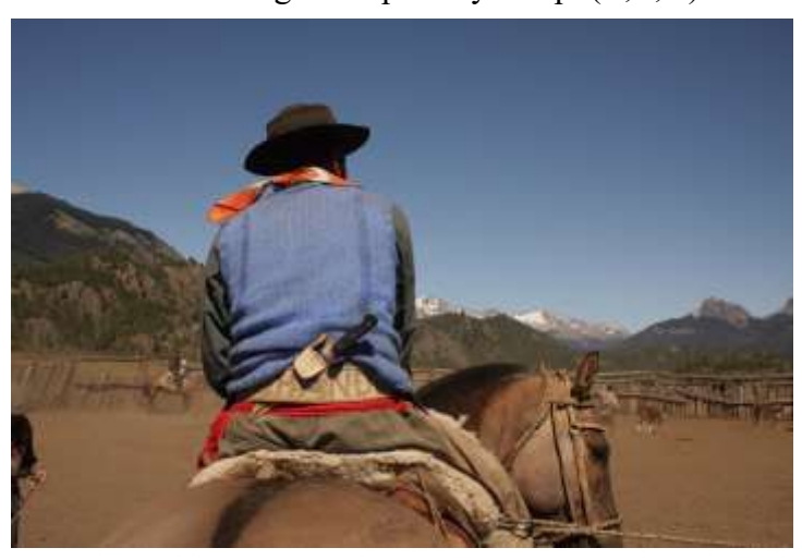
Day 7 - Scrambled eggs and bacon for breakfast in camp before riding on to Felipe's homestead, at the edge of the forest and close to the shores of Lake Traful. After about 4 hours riding arrive at the homestead where Felipe's wife Marta is preparing a delicious lunch. In terms of the 'gaucho experience' this day, amongst the barns and corrals of the old farmstead, is about as authentic and immersive as it gets. The afternoon to relax, walk or ride along the lake and swim before a delicious asado dinner, a traditional "al asador" (Argentine Lamb). Night at Felipe's. (B,L,D)

Day 8 - Breakfast and depending on onward travel plans there may be time for a short ride or swim. Then a 20 minute walk to the beach, where you say farewell to the team and meet the boat which will take you across the lake to Villa Traful where your luggage and a mini bus are waiting. A drive of about 1 ½ hours to Bariloche airport to meet flights back to Buenos Aires departing around 14.00-15.00 and onward journey (B)