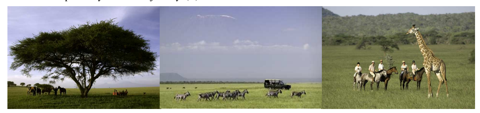
Day 7 - Breakfast and depart by private charter or safari link scheduled flight to Nairobi, Wilson airport. Transfer to the international airport for your onward journey. (B)

Days 3 to 6 - Four full days at Ol Donyo Lodge with a choice of activities that can include morning or afternoon rides, game drives and guided walks. You can also try a mountain bike, visit a Masai manyatta or join one of the conservation initiatives such as the collared lion tracking project. Guided day trips to Amboseli National Park are another option - or simply relax and enjoy the wonderful surroundings. Dinner and four nights Ol Donyo Lodge. (B,L,D)